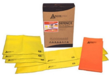
Utility Box Kit #17751

Includes: (3) DefenderBags, and (2) BoomBags for the equivalency of 9 sandbags