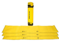
BoomBags (3) #17752

Includes: (3) DefenderBags, and (2) BoomBags for the equivalency of 9 sandbags